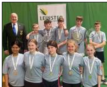
Mountrath Badminton Club winners at recent tournaments