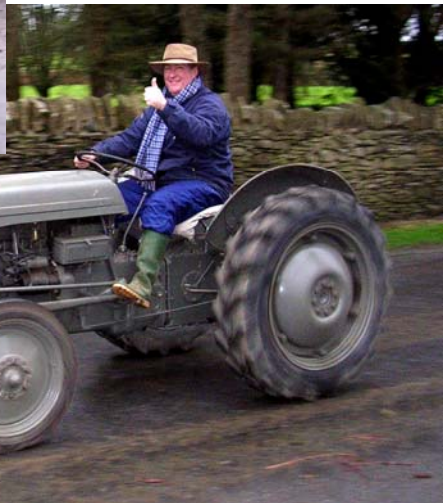
Participants in the Clonenagh National School vintage car and tractor run on Friday 28th of December 2012