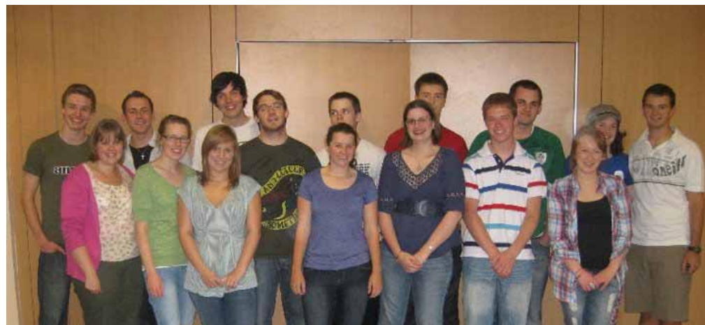
Past members of the Athy and Clonenagh Youth Groups during their reunion at the Church of Ireland Centre in Athy, Co. Kildare.