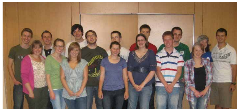
Past members of the Athy and Clonenagh Youth Groups during their reunion at the Church of Ireland Centre in Athy, Co. Kildare.