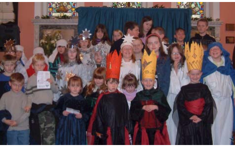
Children from Clonenagh NS at the Family Service in St. Peter's Church on the 14th of December.